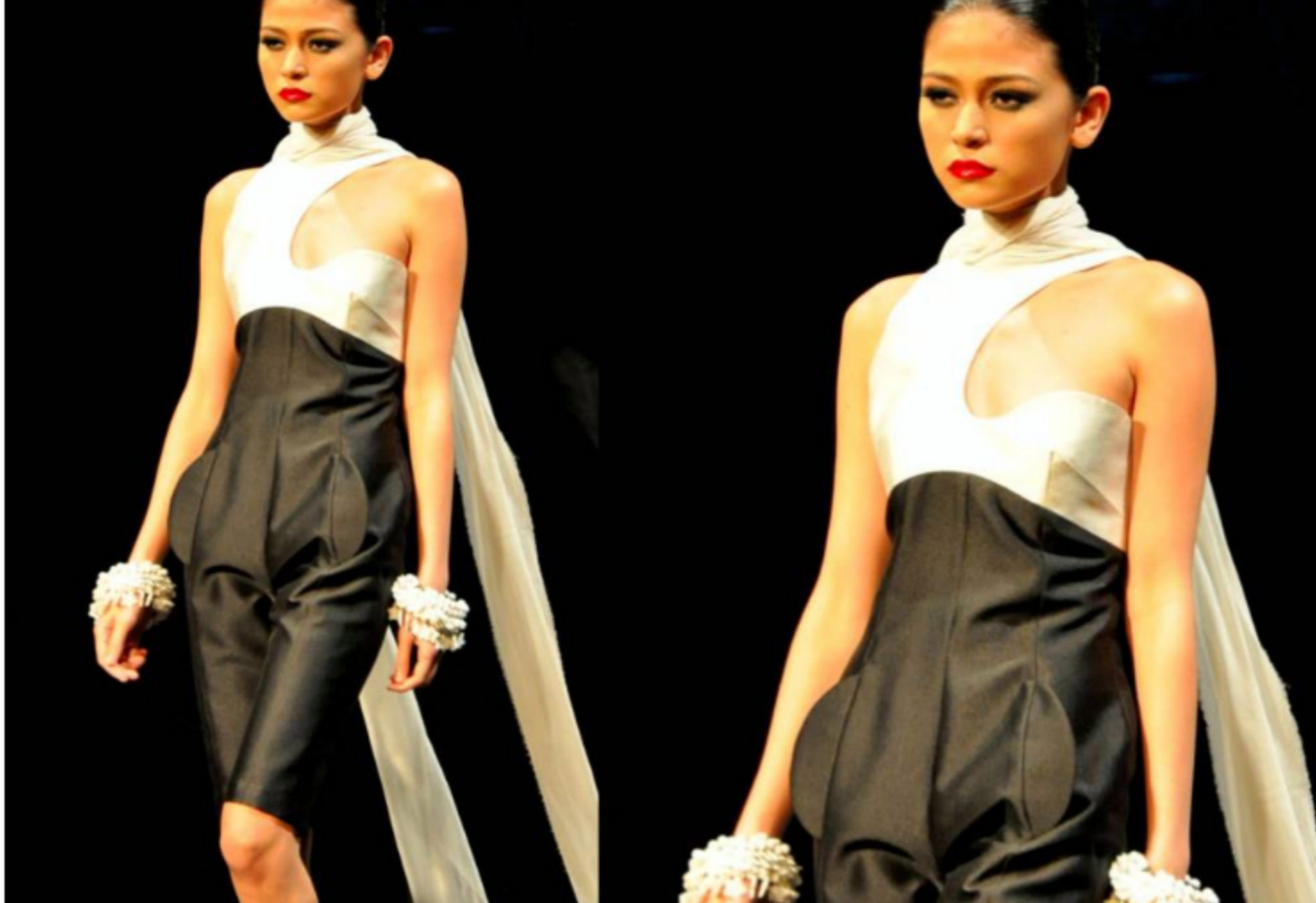
Another take on Jumpsuit...love the playfulness of the curves and the color.