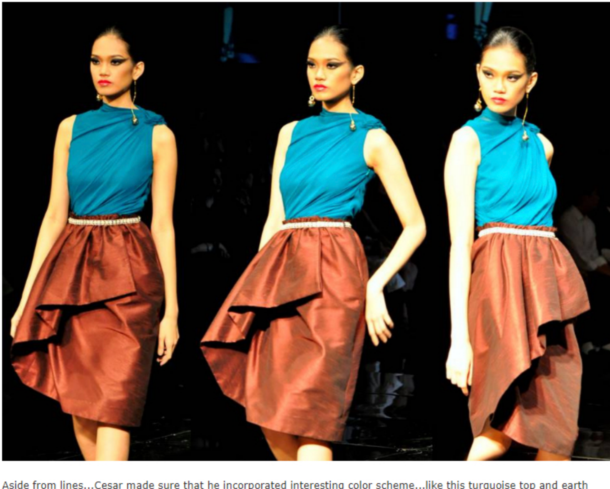
Aside from lines...Cesar made sure that he incorporated interesting color scheme...like this turquoise top and earth tone skirt.

These are the opening and closing acts for SLIMS Fashion Show last PFW S/S 2012. Cesar Gaupo showed marriage of shapes, lines, fabrics and colors. Perhaps the most prominent feature on his collection is the "wave" which celebrates curves of a female body.