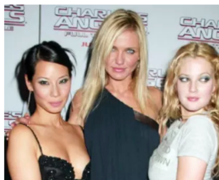
Lucy Liu Never Got Married, and Now You Know Why Dailyforest | Sponsored